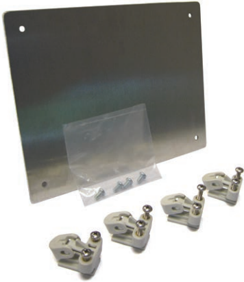
Includes mounts, screws and panel.